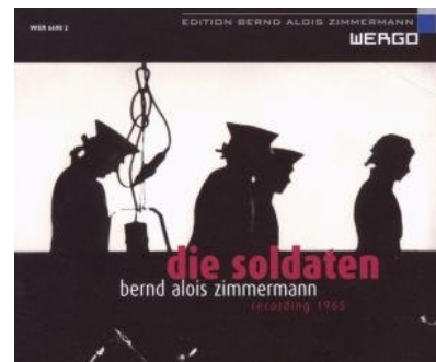
Zimmermann: Die Soldaten Audio CD; IMPORT Wergo Germany