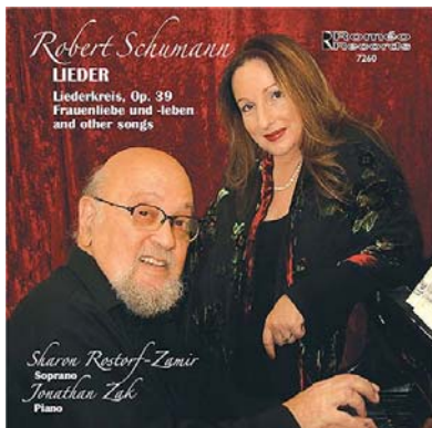
Schumann: Lieder Audio CD; IMPORT Romeo Records