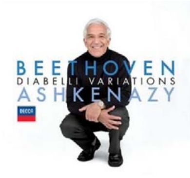
Beethoven: Diabelli Variations Audio CD Decca